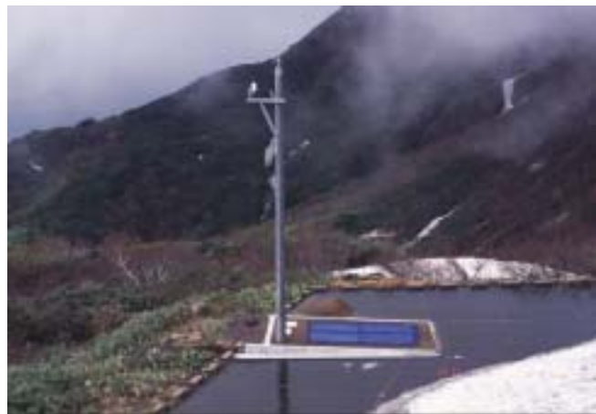
Figure 1: Data Collection Platform (DCP).

A snow observation network comprising seven observation sites was established in mountainous areas in 1994 by the National Research Institute for Earth Science and Disaster Prevention (Nakamura et al. , 1997). Five observation sites were simultaneously installed at the foot of various mountains throughout Japan. The observation sites