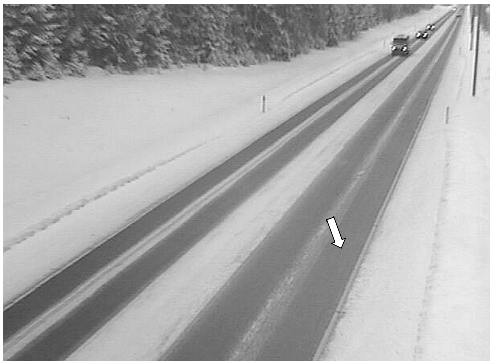
Figure 1 A picture of the field trial site taken by the road weather camera. An arrow marks the DRS511 road sensor. ROSA Road Weather Station is located outside the view.

The measurements were carried out by the Vaisala state-of-art DRS511 road sensor [1] and analyzed by the ROSA Road Weather Station. From the wide range of output data, the thickness of ice and water were used. To get the most representative data, DRS511 was located in the wheel track of the lane.